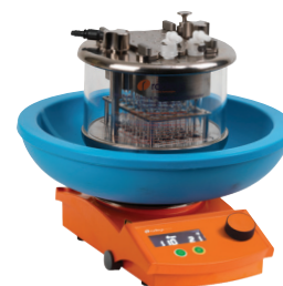
Optional HDPE cooling reservoir for chilled reactions to -78°C using dry ice and acetone

Designed for the synthesis of small compound libraries and drug discovery