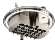
Combined reflux and additions head with nickel condensing fingers