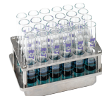
Reaction block fits directly into Genevac vacuum centrifuges