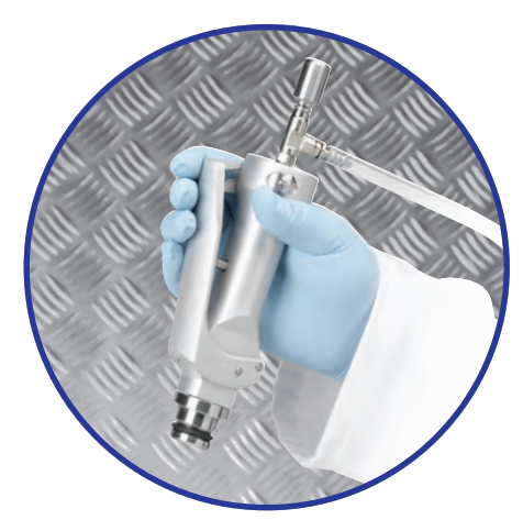
SpeediFlow Booster allows pressurisation of individual columns to increase flow rates and speed up your work-ups